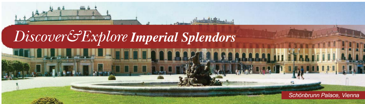
Schönbrunn Palace, Vienna